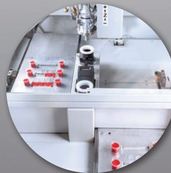
Closeup: dual shuttle table