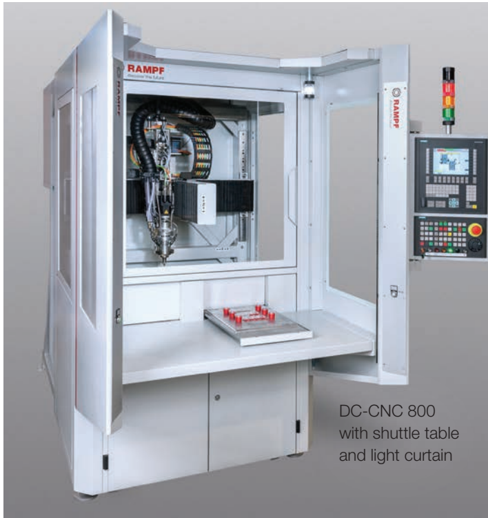
DC-CNC 800 with shuttle table and light curtain

Compact and flexible – the new dosing system for dynamic sealing, encapsulating, and bonding