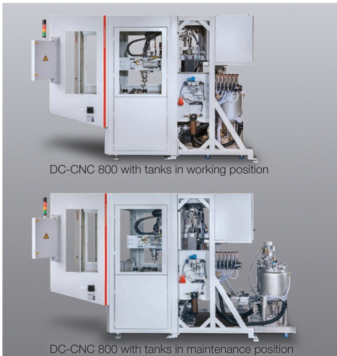
DC-CNC 800 with tanks in working position