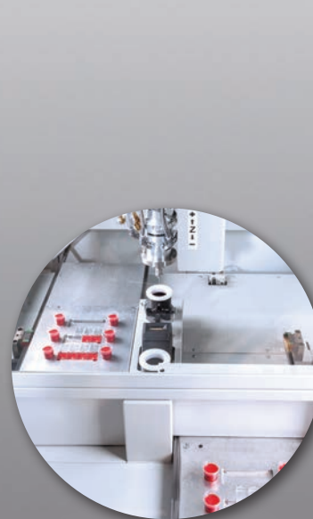
Closeup: dual shuttle table